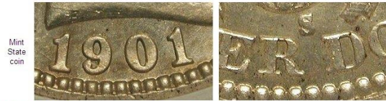
Mint State coin

Obverse B: Both 1's are centered over the left side of denticles, second 1 is not close to the bust (much lower than Die A). Reverse B: S is more upright and nearly centered between R and D. Note: Use extra caution here, as there is also at least one 1901-P date position that is close to the 1901-S Obverse Die B, although not exactly the same.