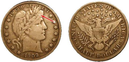
Very Fine (VF 20). All of the letters of LIBERTY will be easily visible. Still more detail in laurel wreath. On many dates, the band under LIBERTY (see arrow) will be complete on VF30 coins (VF-EF). On the back, most of the feathers will be visible.